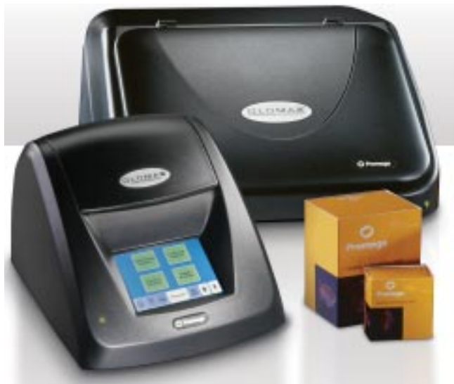
Figure 1. The GloMax™ Luminometry Systems. Bioluminescent assay systems and reagents are available separately (Table 1).

Bioluminescence has long been recognized as an optimal method for measuring biological activities (1–3). The hallmark bioluminescent assay is the luciferase gene reporter assay for quantitative measurement of gene expression. The original firefly luciferase assay system yields linear results over several orders of magnitude, and low background luminescence is found in the host cells or assay chemistry. Promega has developed a suite of bioluminescent assays that maintain this high quality but measure other biochemical or cellular activities of interest to the biological researcher (Table 1). Furthermore, these assays are easy-to-use and adaptable to different throughput needs.